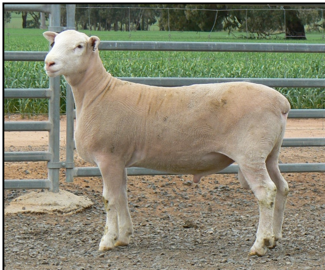
Aberdeen 582-16 (tw)