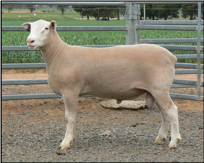
Aberdeen 757-16 (tw)