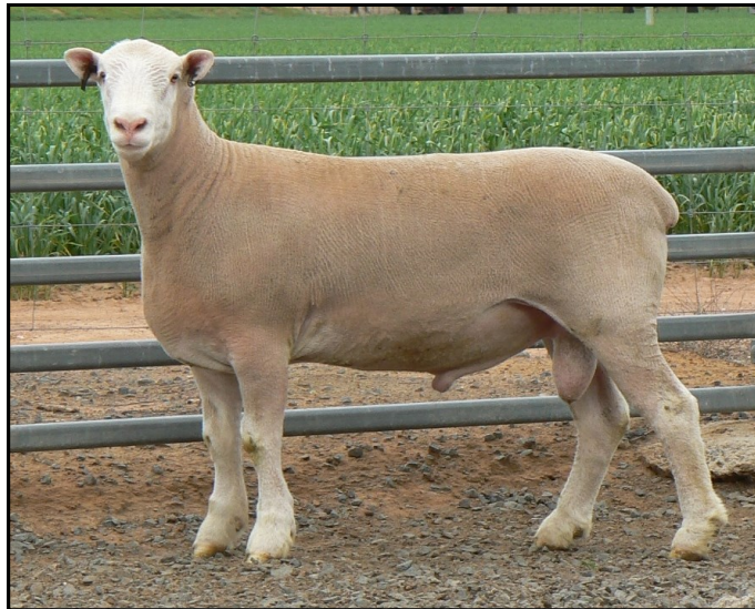
Aberdeen 519-16 (tw)