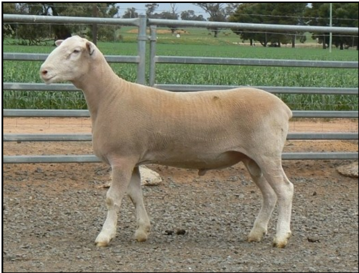
Aberdeen 547-16 (tw)