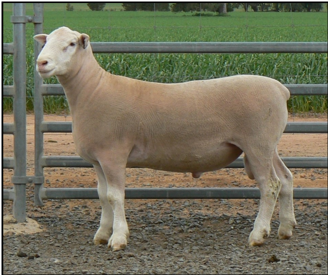
Aberdeen 611-16 (tw)