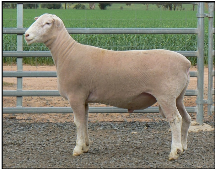
Aberdeen 560-16 (tw)

Sire: North Ulandi 23-15 SOD: Aberdeen 374-13 Dam: Aberdeen 325-15